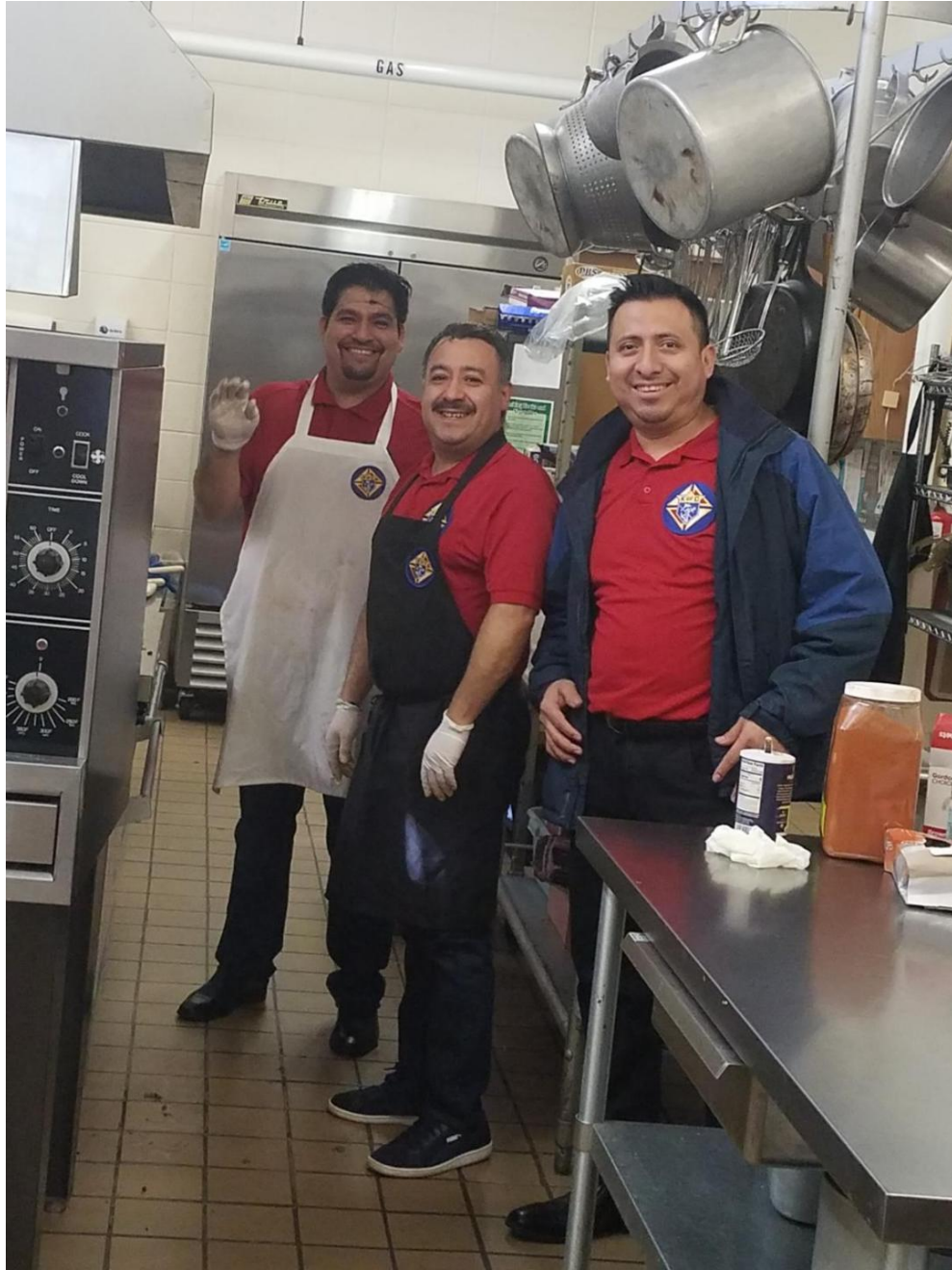
Members of Divina Misericordia Council #16994 at St. Aloysius Parish in Sauk City are getting ready to serve an authentic Mexican taco meal.